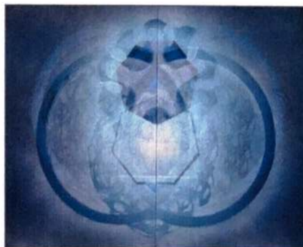
40" x 36" "Diminished Sevenths" 2010

One of 5 paintings dealing with musical intervals