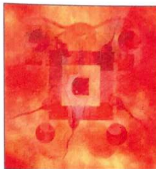
50" x 50" "Muladhara" 2004

Over 800 paintings, drawings and designs included in public, private and corporate collections throughout the world.