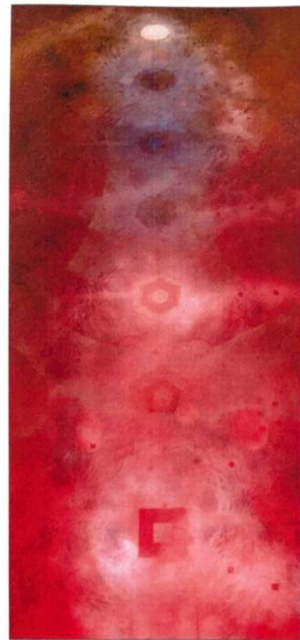
192" x 96" "The Way of Life" 2006-07

mixed mediums on untreated cotton canvas