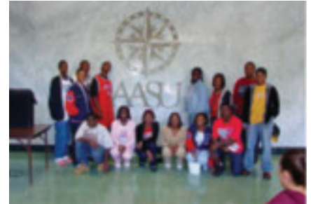
Several students pose for a group photo while touring Armstrong Atlantic State University during an April Honor Roll trip to Savannah

All of these efforts help to maintain a focus of augmentation and improvement in academics, social and comprehensive behaviors. UB continues to plant those seeds and cultivate the productions.